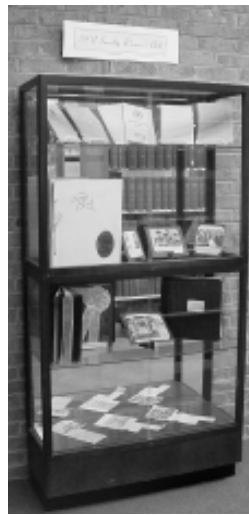
Women's Faculty Club Display