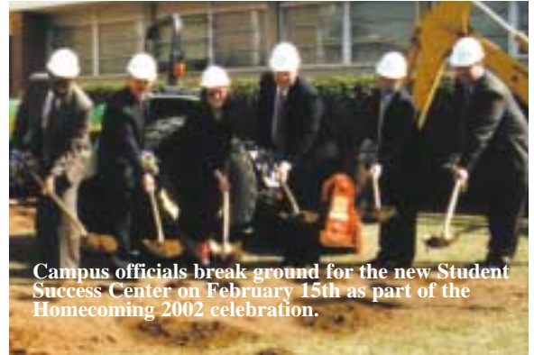
Campus officials break ground for the new Student Success Center on February 15th as part of the Homecoming 2002 celebration.

According to designers, the building will reinforce and enliven the pedestrian-friendly nature of the campus, and will help anchor the campus master plan as well. In addition, the facility will include features to encourage after-hours student activities, and will consolidate many of the student services into one