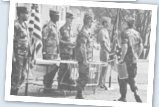
The ROTC program was established in 1981 with 20 students, and grew to more than 70 by 1985. The program ended in 1994.