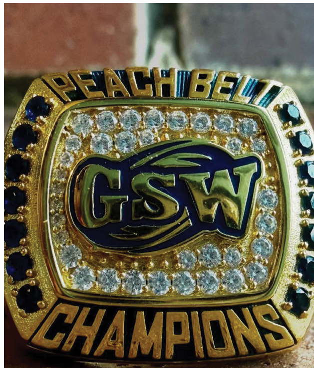
2025 Peach Belt Conference Softball Tournament Champions